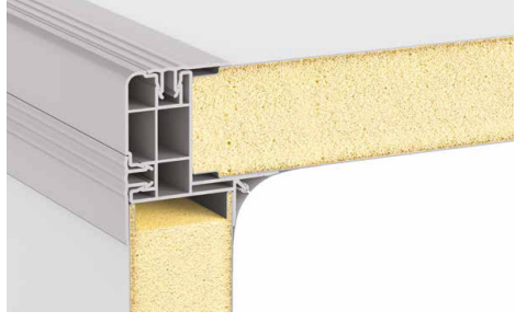
Glasbord® with Surfaseal® Modular Panels (Hygicold)